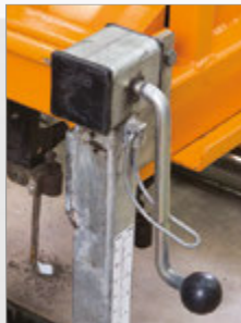
Quick, single lever tine depth setting for easy adjustment

The Aer-Aid system injects air directly into the root zone speeding up the aeration process, moving air uniformly throughout the root zone for complete aeration – not just where the tines have penetrated.