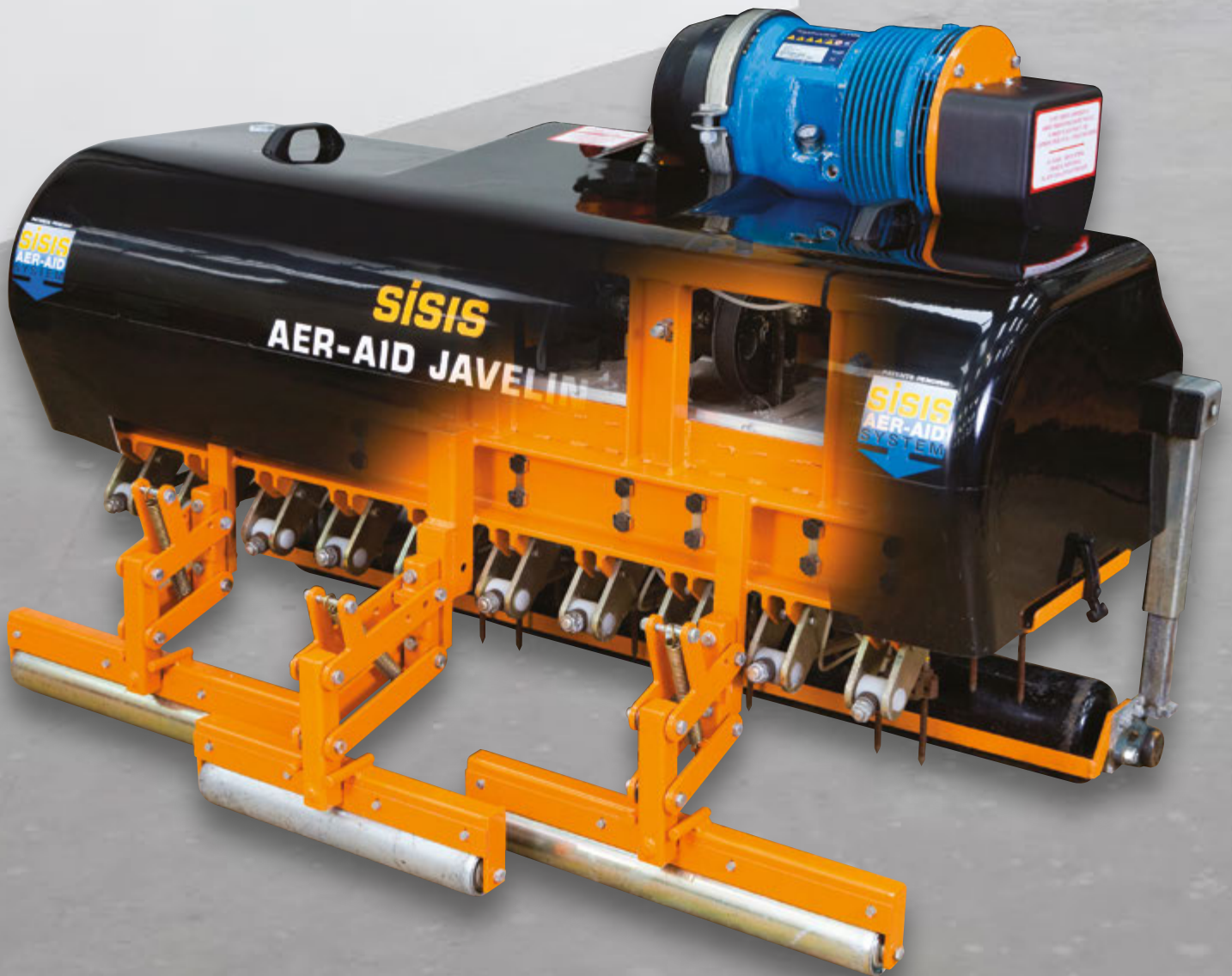
Image shows Javelin Aer-Aid complete with rear roller

Football, Hockey, Rugby | Cricket | Golf | Local Authority & Contractors