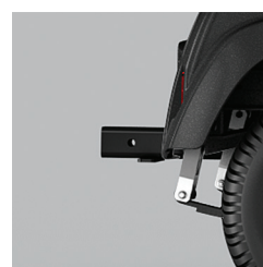
Rear Receiver Hitch